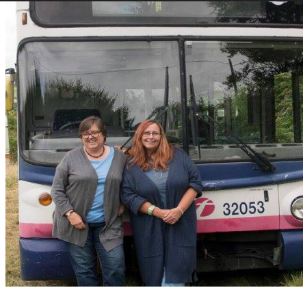
Bus Shelter North Devon team

We need people to 'get on board' in a number of ways; As well as helping in a practical 'hands on' sense, we need supporters like businesses to get themselves advertised on the back of the bus by donating £50+ to our project, we need other businesses and craftsmen to help fitting, and with supplies of wood,