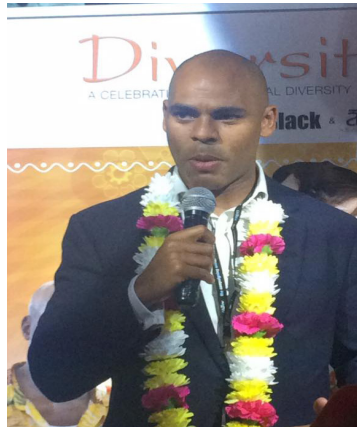
Marvin Rees (Mayor of Bristol)