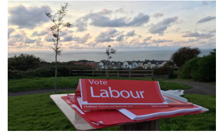
Romantic canvassing sunset

If people think the unity of the European continent doesn't matter - it absolutely does matter! The Tory party is absolutely destroying this country. In the Thatcher years they got rid of most of our industry and now it's looking like Brexit will probably get rid of what little remains. If the car plants that are located in this country are undermined, because of the new deal they will just go. They won't hang about.