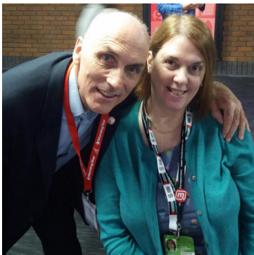
Chris Williamson MP leans in for a selfie