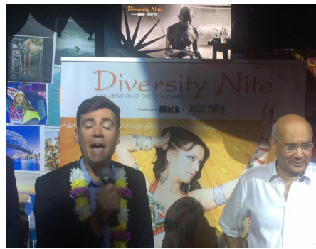
Andy Burnham (Mayor of Manchester)