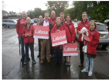
NDCLP canvassers battling weather in Barnstaple