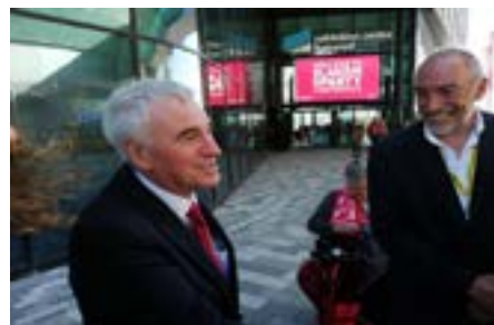
John McDonnell met the ND CLP team and we reminded him of our invitation to visit North Devon.

To be a candidate you need to be resident in North Devon and registered to vote. To be a Labour Candidate you need to have been a member for at least 12 months. If you are interested please respond to this email saying you'd like more information and we can have a conversation about what is involved.